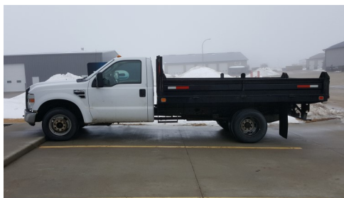
Our "New" Bike Ministry Truck

Another result of expanding our Faith Community Nursing staff is the ability to train student nurses during clinical education classes held at the Center of Hope. I have witnessed great interactions between the student nurses and our guests. Student nurses learn that not everyone has the access to adequate medical care, resources for med-